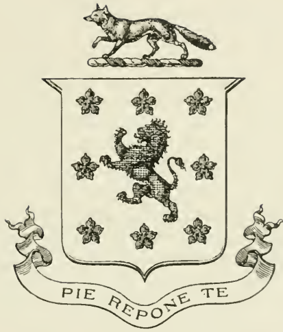
THE PIERREPONT ARMS.